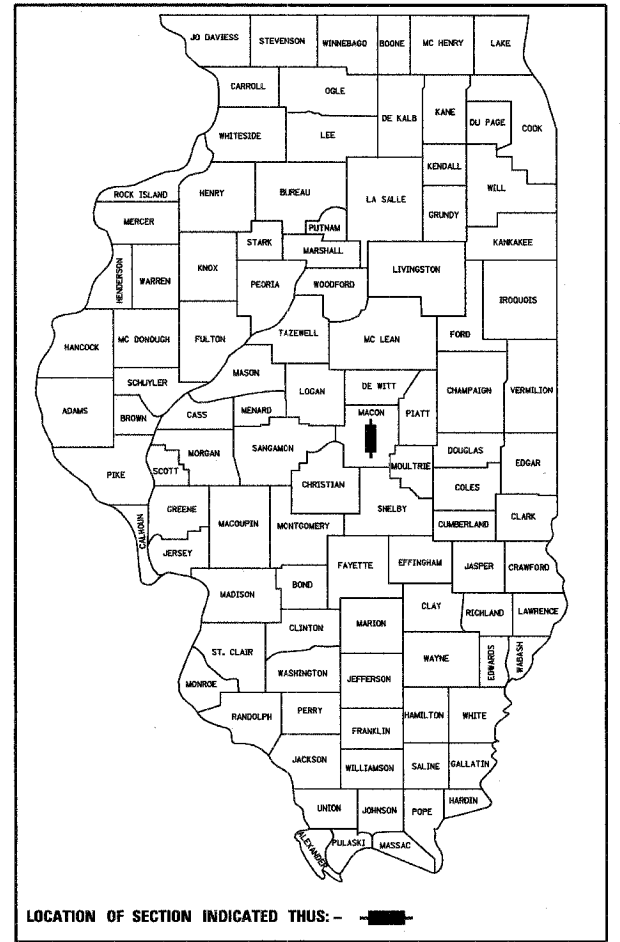
LOCATION OF SECTION INDICATED THUS: - [Black Box]