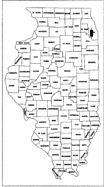
LOCATION OF SECTION INDICATED THUS: