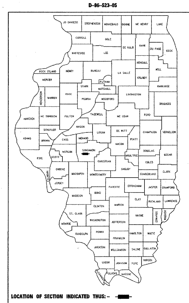
LOCATION OF SECTION INDICATED THUS: - ■ -

FAU 8027 (TAINTOR RD.) ROADWAY CLASSIFICATION: OTHER PRINCIPLE ARTERIAL CRS: 5.4 (2005) ADT 1700 (2003) PU, 175 (2003) MU