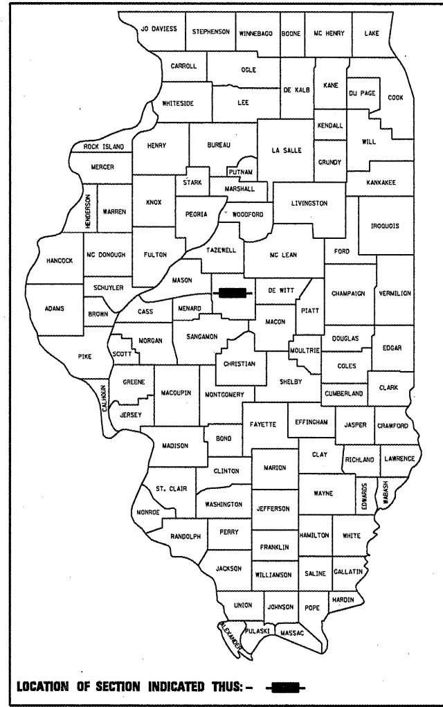
LOCATION OF SECTION INDICATED THUS: - ■ -