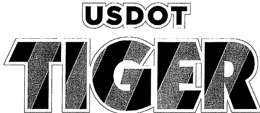
USDOT TIGER Vector-Based, Vinyl-Ready Pictograph

COLORS: OUTLINE -- WHITE (RETROREFLECTIVE) USDOT LEGEND -- BLACK TIGER DIAGONALS -- BLACK, ORANGE (RETROREFLECTIVE)