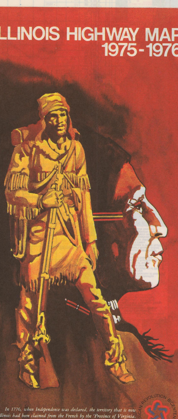
In 1776, the Indians were displaced, and the territory that is now Illinois had been claimed from the French by the Province of Virginia.