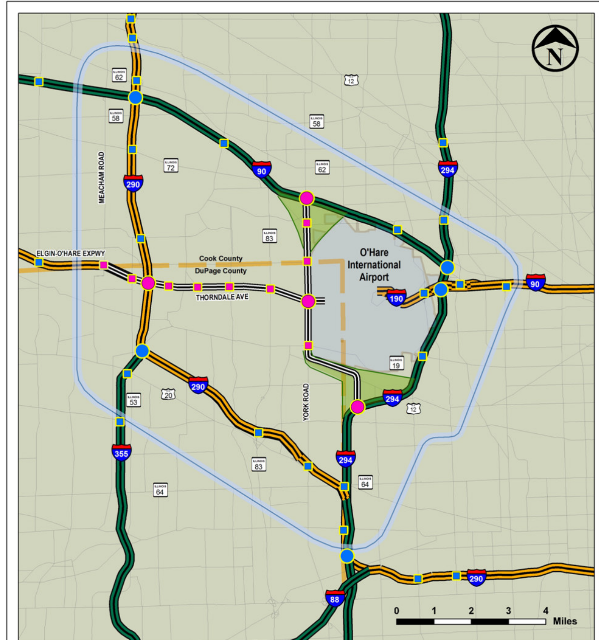
Group 2, Option 3 (Strategy 203)