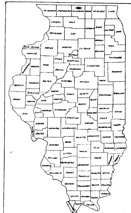
LOCATION OF SECTION INDICATED THIS:—

Note: Structural steel shall be delivered f.o.b. Railway Team Track nearest the bridge site located near the intersection of Sandy Hollow Road and Kishwaukee Street in Rockford. Except that delivery may be made f.o.b. bridge site by truck if suitable arrangements are made with the contractor of section 3B.