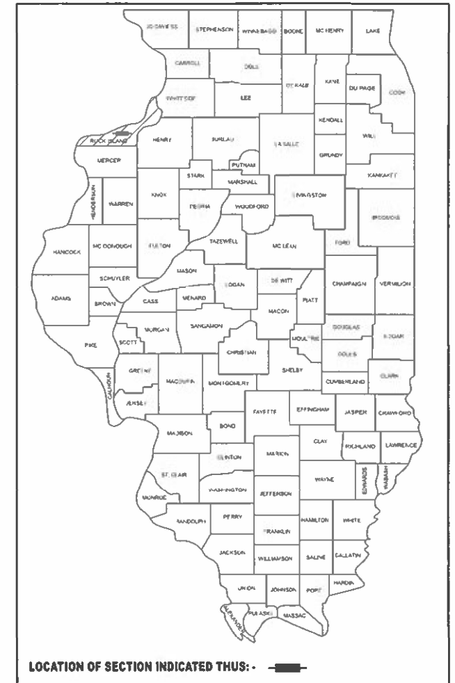
LOCATION OF SECTION INDICATED THUS: -