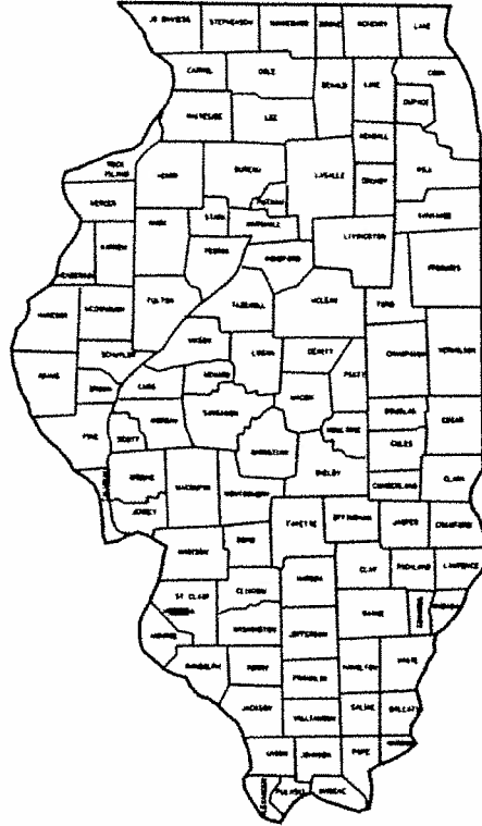
LOCATION OF SECTION INDICATED THUS ■

DEPARTMENT OF TRANSPORTATION PLANS FOR PROPOSED FAU 9185 (LAKE BLVD) SECTION 10-I-1 PATCHING-CM ST. CLAIR COUNTY C-98-047-13