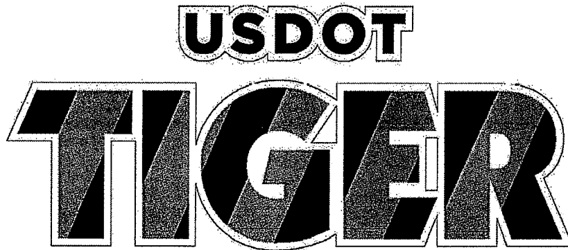
USDOT TIGER Vector-Based, Vinyl-Ready Pictograph

COLORS: OUTLINE = WHITE (RETROREFLECTIVE) USDOT LEGEND = BLACK TIGER DIAGONALS = BLACK, ORANGE (RETROREFLECTIVE)