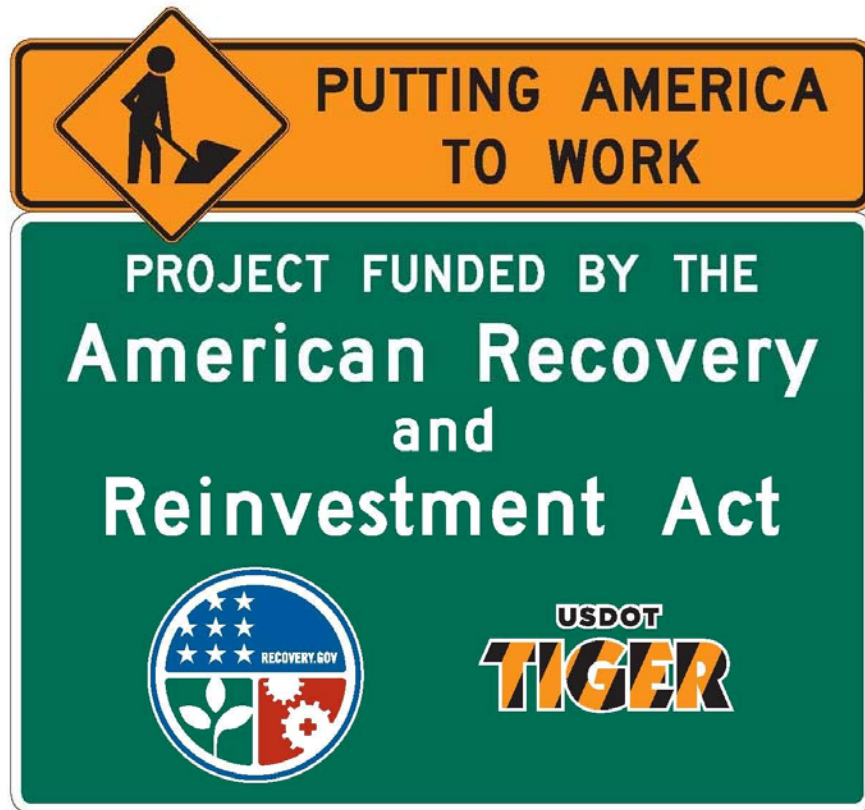
PROJECT FUNDING SOURCE SIGN ASSEMBLY