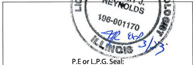
P.E or L.P.G. Seal: