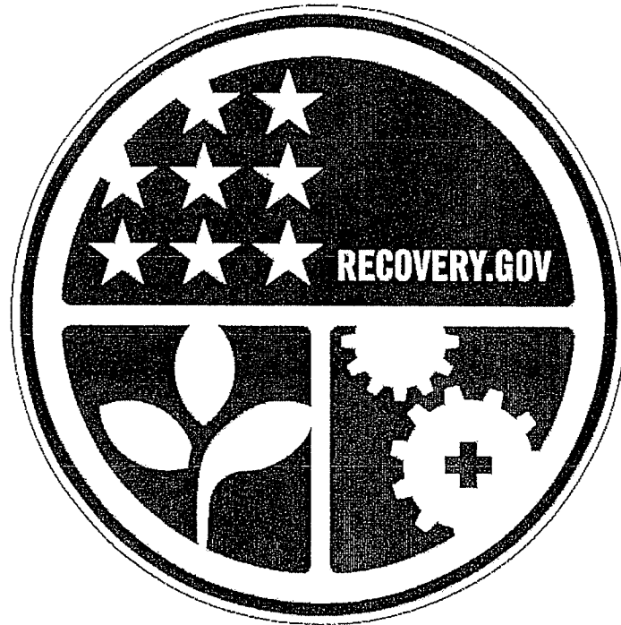
RECOVERY Vector-Based, Vinyl-Ready Pictograph

COLORS: LEGEND, OUTLINE — WHITE (RETROREFLECTIVE) BORDER — BLUE (RETROREFLECTIVE) BACKGROUND (UPPER) — BLUE (RETROREFLECTIVE) BACKGROUND (LOWER RIGHT) — RED (RETROREFLECTIVE) BACKGROUND (LOWER LEFT) — GREEN (RETROREFLECTIVE)