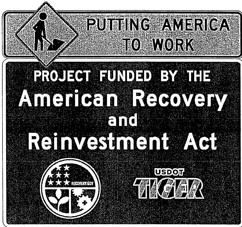
PROJECT FUNDING SOURCE SIGN ASSEMBLY