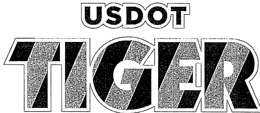
USDOT TIGER Vector-Based, Vinyl-Ready Pictograph

COLORS: OUTLINE — WHITE (RETROREFLECTIVE) USDOT LEGEND — BLACK TIGER DIAGONALS — BLACK, ORANGE (RETROREFLECTIVE)