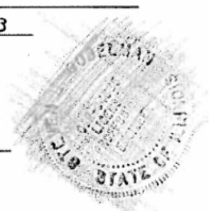
P.E. or L.P.G. Seal: