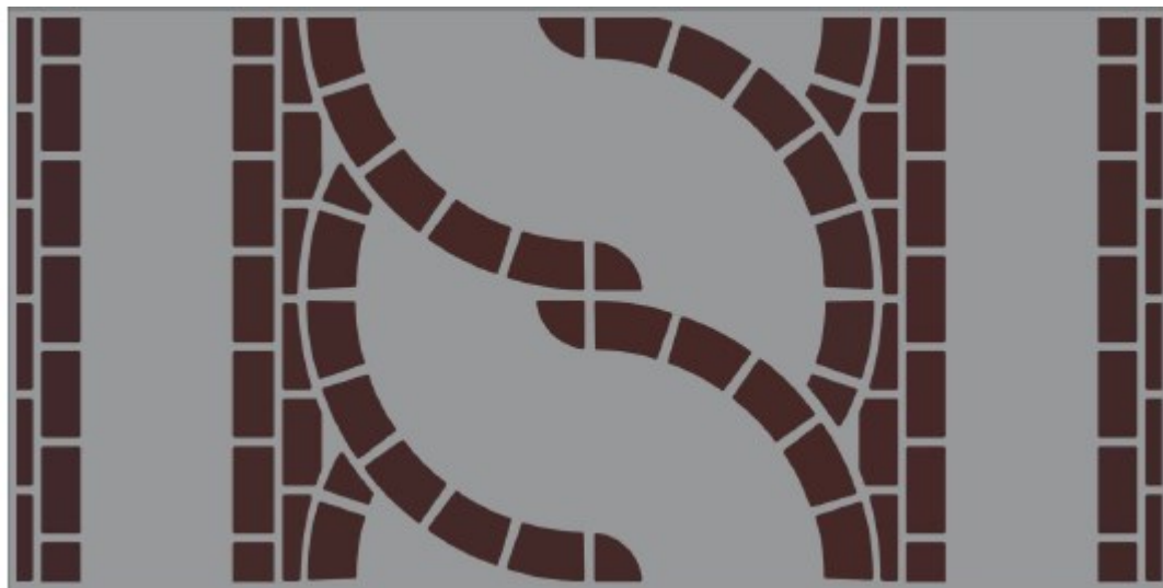
Stencil design pattern for brick red MMA color - (#2)

Basis of Payment: This work will be paid for at the contract unit price per square foot for PAVEMENT MARKING (SPECIAL) and shall include all labor, materials, equipment, as described and any ancillary work necessary to complete the application of the PAVEMENT MARKING (SPECIAL).