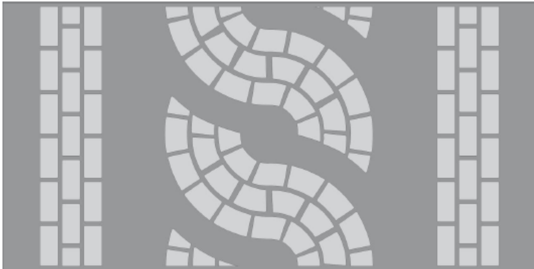
Stencil design pattern for light gray MMA color - (#1)