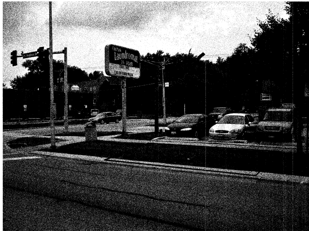
THIS IMAGE IS NOT TO SCALE