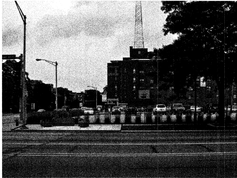
THIS IMAGE IS NOT TO SCALE