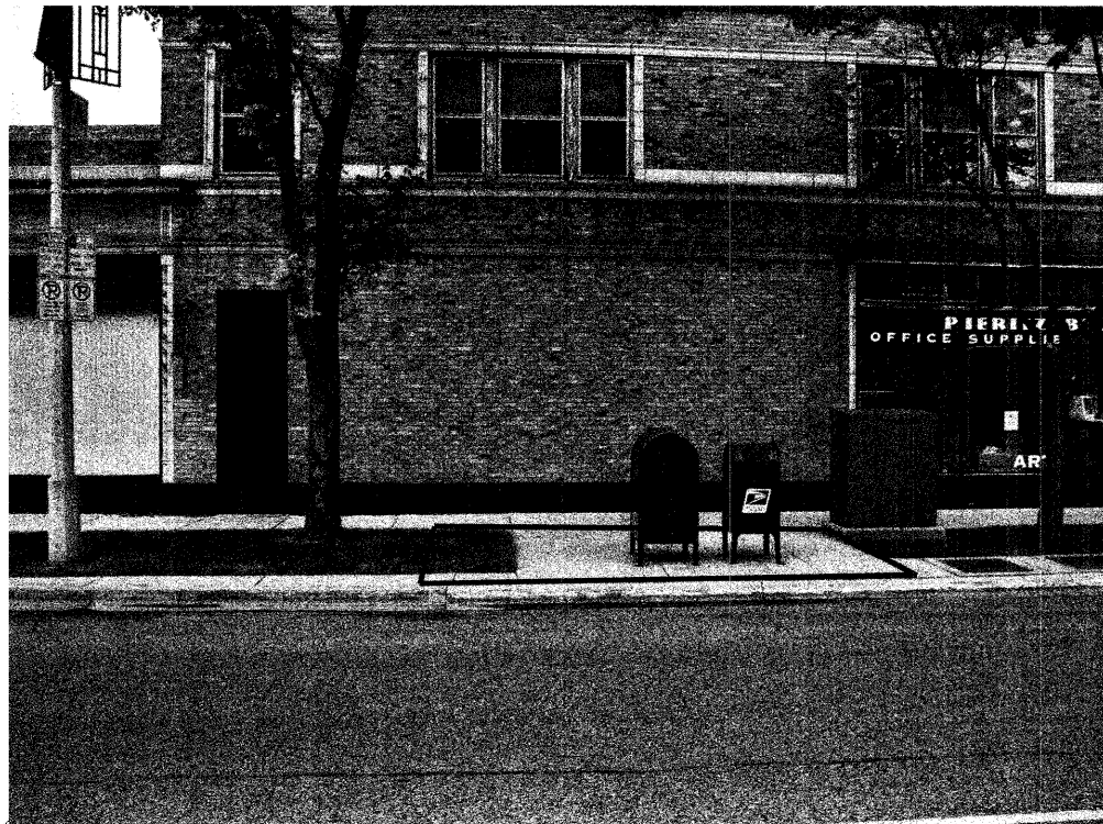
THIS IMAGE IS NOT TO SCALE