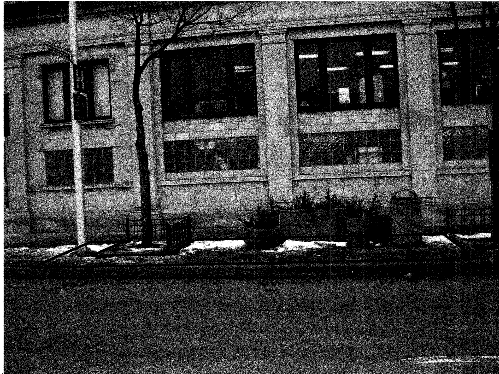
THIS IMAGE IS NOT TO SCALE