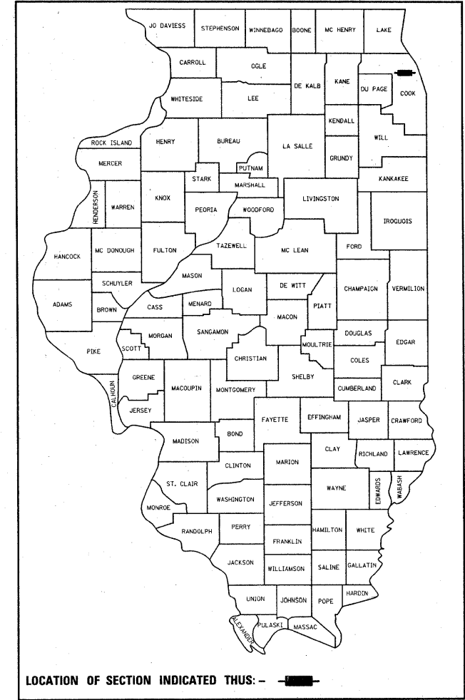
LOCATION OF SECTION INDICATED THUS: - [black rectangle] -