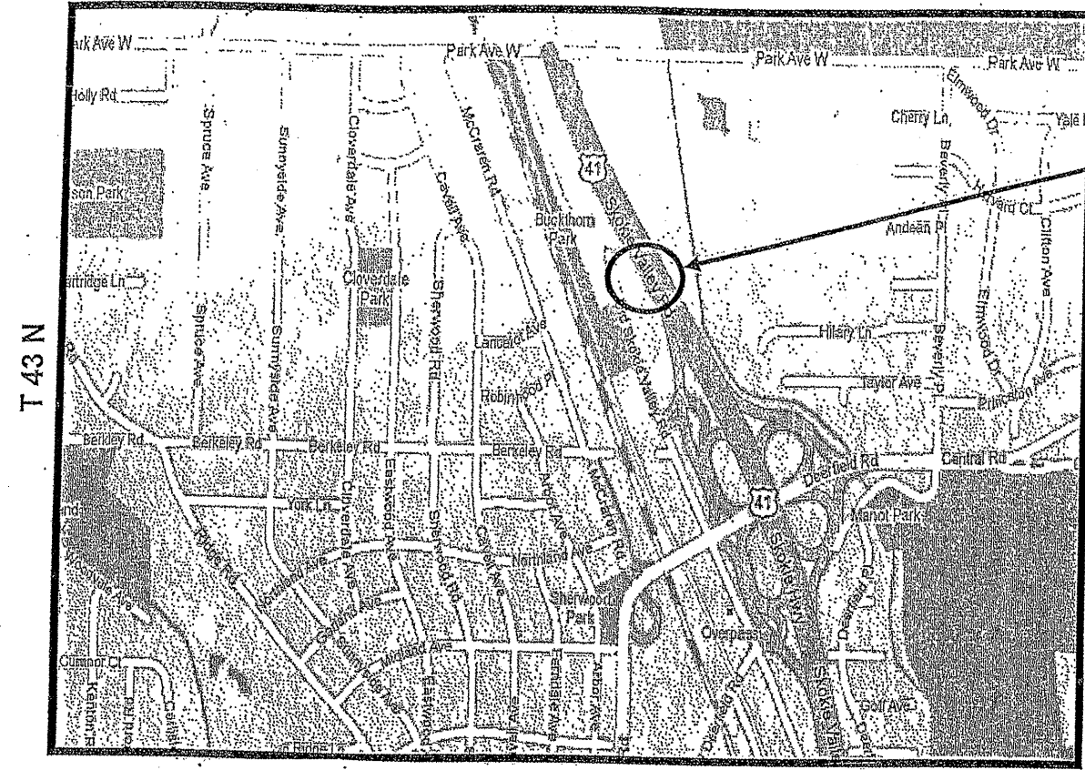
VILLAGE OF HIGHLAND PARK DEERFIELD TOWNSHIP LAKE COUNTY

LOCATION 18: SB ROUTE 41 AT DEERFIELD ROAD EXIT RAMP, LEFT SIDE ROADWAY IN MEDIAN.