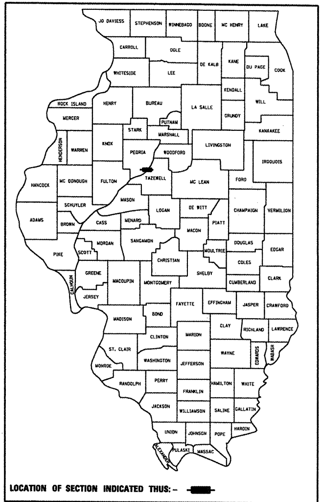
LOCATION OF SECTION INDICATED THUS: —■—