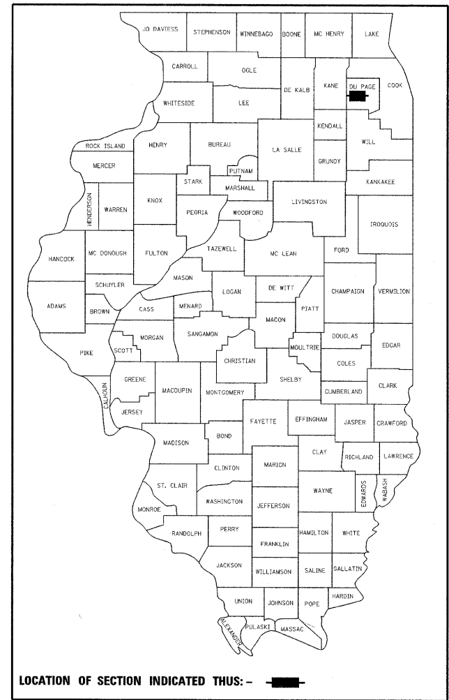
LOCATION OF SECTION INDICATED THIS: - [black rectangle] -