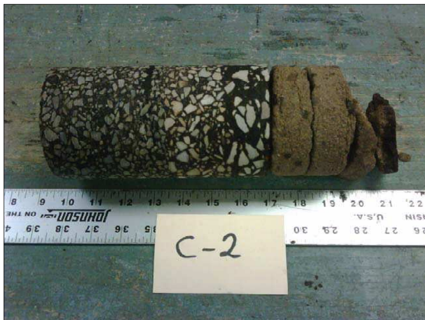
Core No.: C-2 Core Location: Station: 251+39.4; Offset: 69.9' LT; Elevation: 523.8'