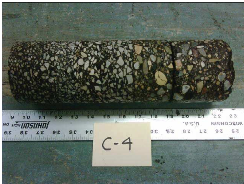
Core No.: C-4 Core Location: Station: 248+46.6; Offset: 50.0' RT; Elevation: 522.7'