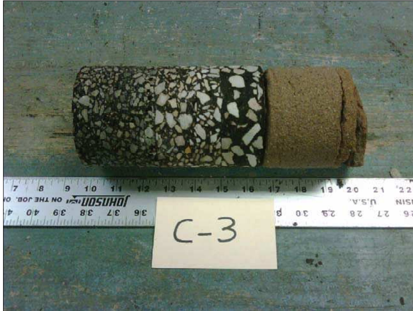
Core No.: C-3 Core Location: Station: 250+17.7; Offset: 4.5' RT; Elevation: 523.0'