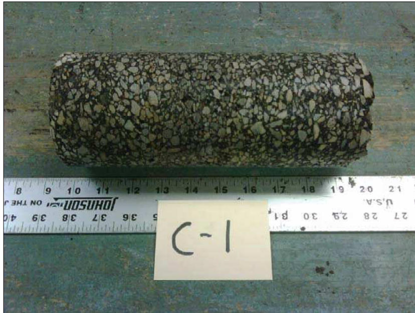
Core No.: C-1 Core Location: Station: 248+44.8; Offset: 109.5' LT; Elevation: 524.1'