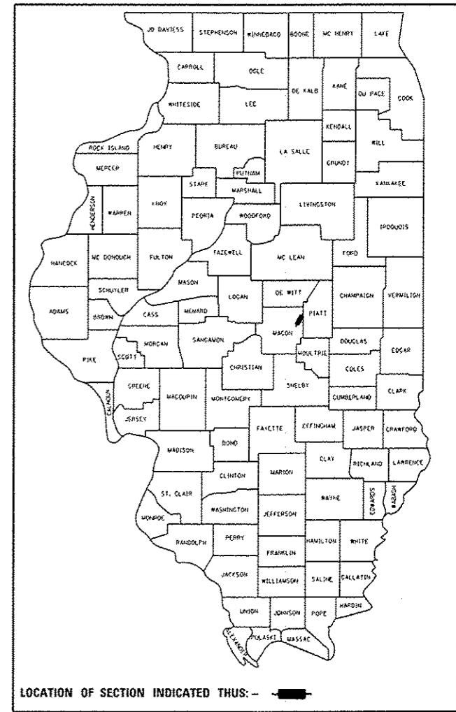
LOCATION OF SECTION INDICATED THUS: —