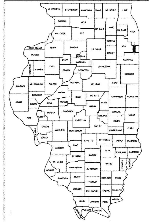
LOCATION OF SECTION INDICATED THIS: -