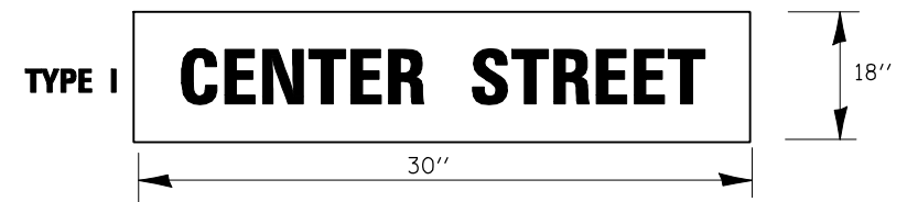
2 EACH LOCATED ON RT 24 STA. 1141+77 RT STA. 1145+27 LT