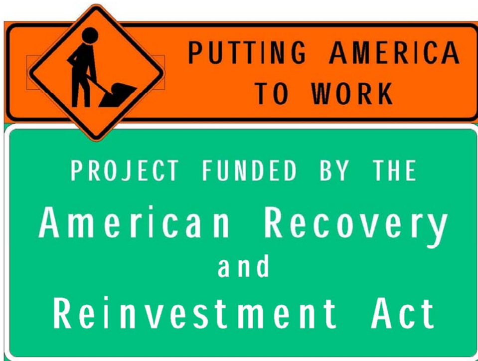
PROJECT FUNDING SOURCE SIGN ASSEMBLY

(Note: Outline of small rectangle on plaque shall be removed.)