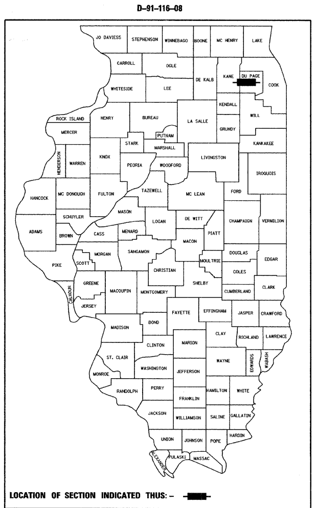
LOCATION OF SECTION INDICATED THIS: - [black rectangle]

GROSS AND NET LENGTH OF PROJECT = 986 FT = 0.19 MI