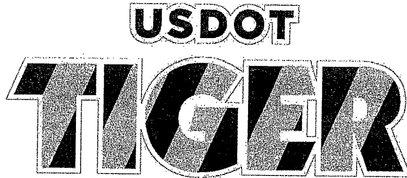
USDOT TIGER Vector-Based, Vinyl-Ready Pictograph

COLORS: OUTLINE - WHITE (RETROREFLECTIVE) USDOT LEGEND - BLACK TIGER DIAGONALS - BLACK, ORANGE (RETROREFLECTIVE)