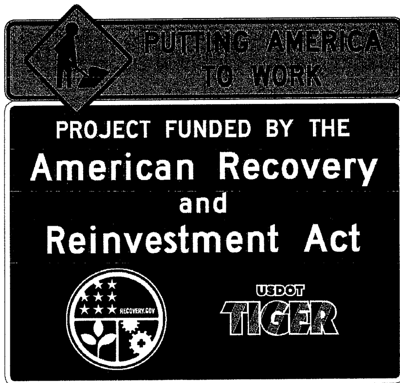
PROJECT FUNDING SOURCE SIGN ASSEMBLY