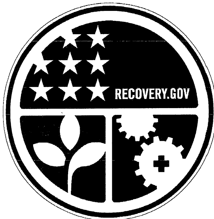
RECOVERY Vector-Based, Vinyl-Ready Pictograph

COLORS: LEGEND, OUTLINE - WHITE (RETROREFLECTIVE) BORDER - BLUE (RETROREFLECTIVE) BACKGROUND (UPPER) - BLUE (RETROREFLECTIVE) BACKGROUND (LOWER RIGHT) - RED (RETROREFLECTIVE) BACKGROUND (LOWER LEFT) - GREEN (RETROREFLECTIVE)