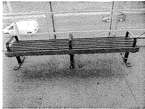
EXISTING BENCH TO BE REMOVED, AND REINSTALLED ON PLATFORM. LOCATION TO BE DETERMINED BY CTA.