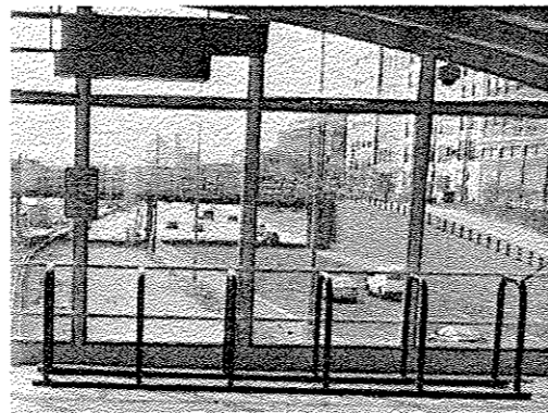
EXISTING BIKE RACK TO BE REMOVED, MODIFIED AND REINSTALLED.