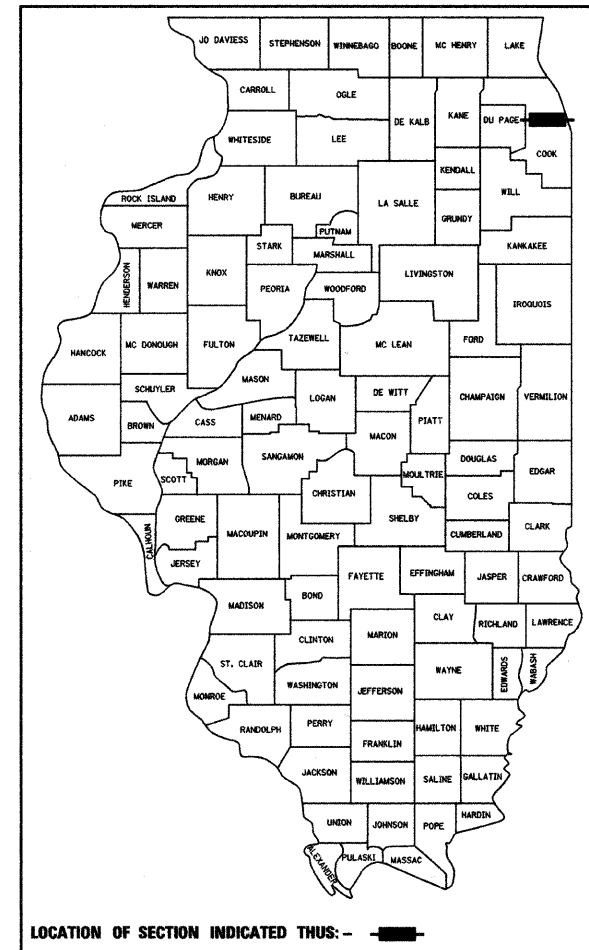
LOCATION OF SECTION INDICATED THUS: —