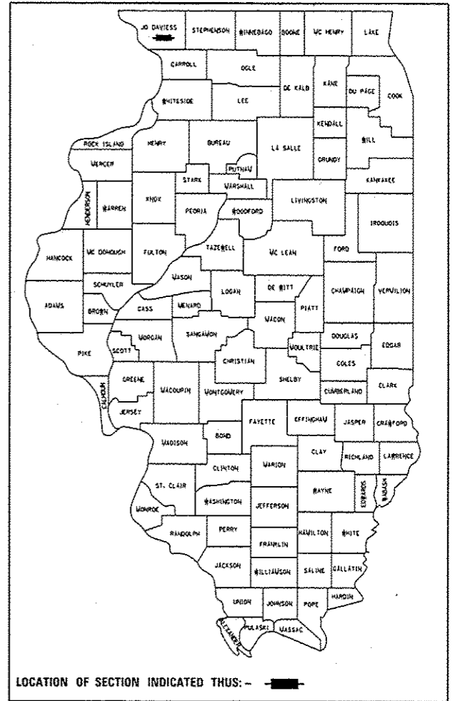
LOCATION OF SECTION INDICATED THUS: - [rectangle symbol]

FOR INDEX OF SHEETS, SEE SHEET NO. 2 FOR STATE STANDARD, SEE SHEET NO. 2