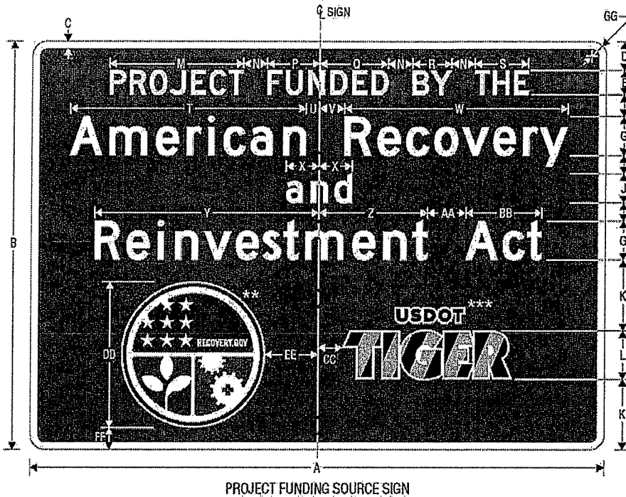
PROJECT FUNDING SOURCE SIGN

NOTE: SIGN SHALL NOT BE INSTALLED WITHOUT PROJECT FUNDING SOURCE PLAQUE