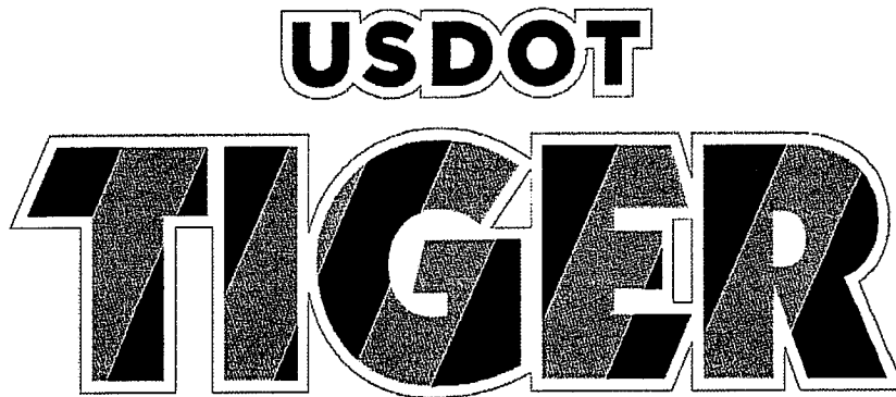
USDOT TIGER Vector-Based, Vinyl-Ready Pictograph

COLORS: OUTLINE — WHITE (RETROREFLECTIVE) USDOT LEGEND — BLACK TIGER DIAGONALS — BLACK, ORANGE (RETROREFLECTIVE)