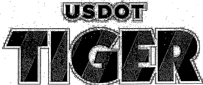
USDOT TIGER Vector Based, Vinyl Ready Pictograph

COLORS: OUTLINE WHITE (RETROREFLECTIVE) USDOT LEGEND BLACK TIGER DIAGONALS BLACK ORANGE (RETROREFLECTIVE)