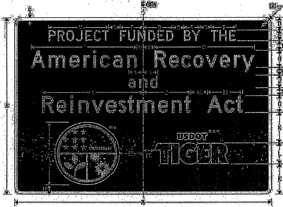
PROJECT FUNDING SOURCE SIGN

NOTE: SIGN SHALL NOT BE INSTALLED WITHOUT PROJECT FUNDING SOURCE PLAQUE