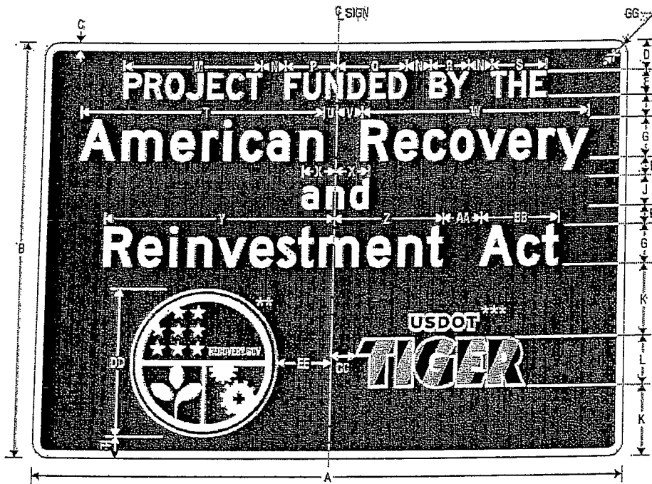
PROJECT FUNDING SOURCE SIGN

NOTE: SIGN SHALL NOT BE INSTALLED WITHOUT PROJECT FUNDING SOURCE PLAQUE