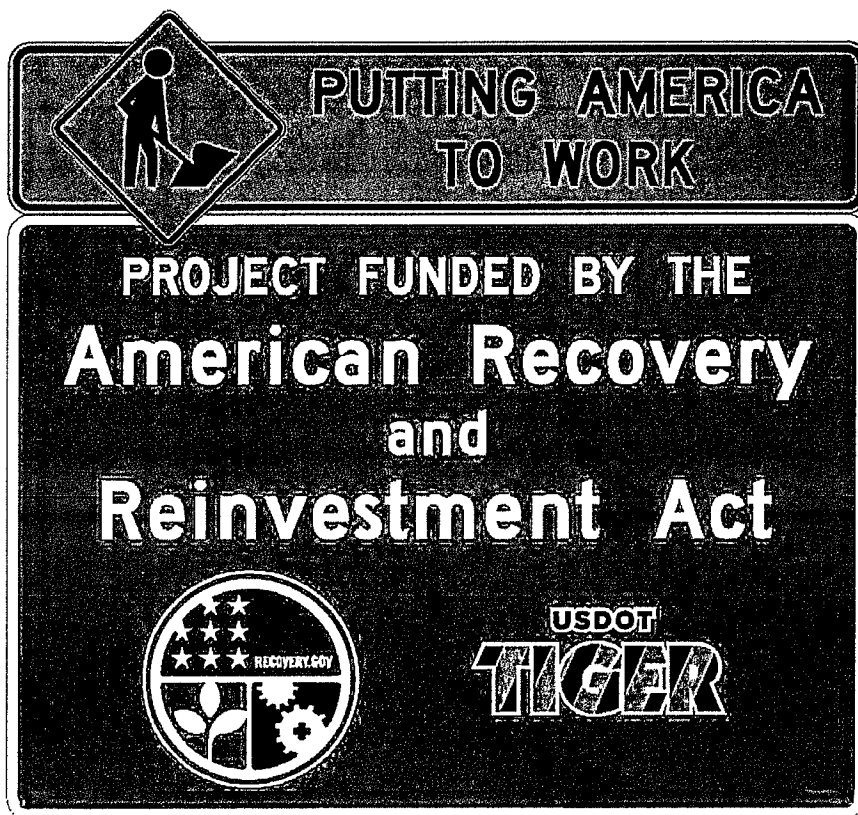
PROJECT FUNDING SOURCE SIGN ASSEMBLY