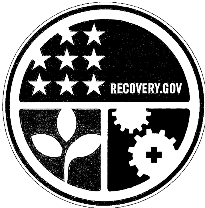
RECOVERY Vector-Based, Vinyl-Ready Pictograph

COLORS: LEGEND, OUTLINE - WHITE (RETROREFLECTIVE) BORDER - BLUE (RETROREFLECTIVE) BACKGROUND (UPPER) - BLUE (RETROREFLECTIVE) BACKGROUND (LOWER RIGHT) - RED (RETROREFLECTIVE) BACKGROUND (LOWER LEFT) - GREEN (RETROREFLECTIVE)