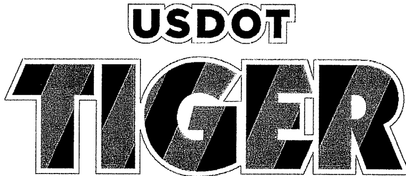
USDOT TIGER Vector-Based, Vinyl-Ready Pictograph

COLORS: OUTLINE — WHITE (RETROREFLECTIVE) USDOT LEGEND — BLACK TIGER DIAGONALS — BLACK, ORANGE (RETROREFLECTIVE)