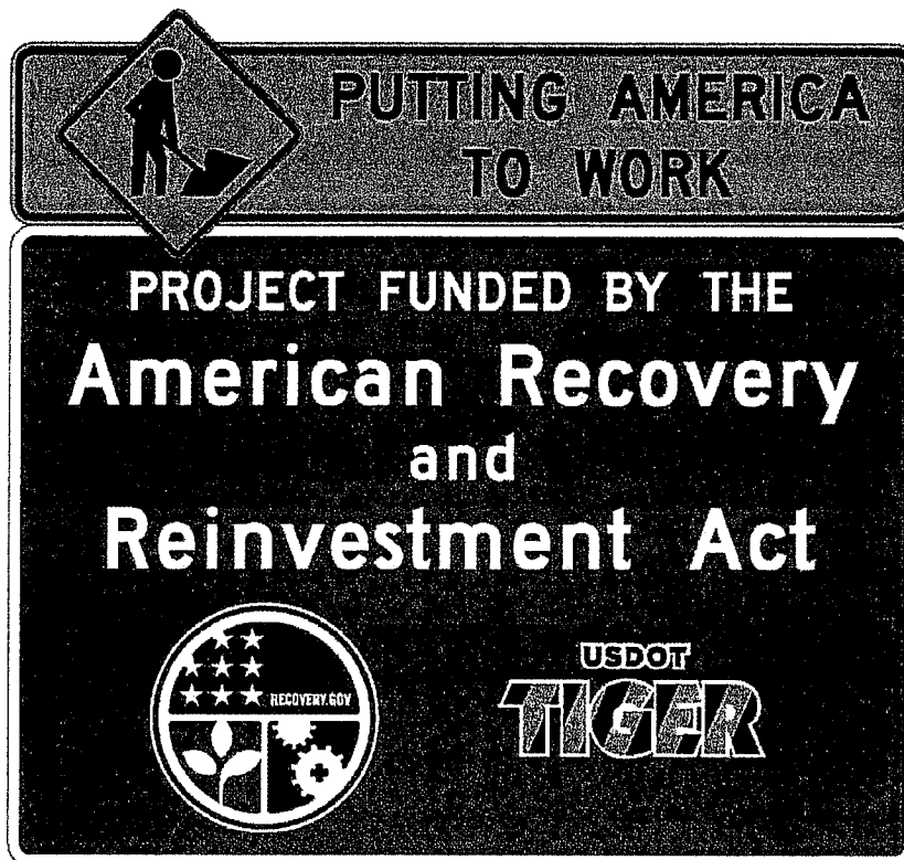
PROJECT FUNDING SOURCE SIGN ASSEMBLY