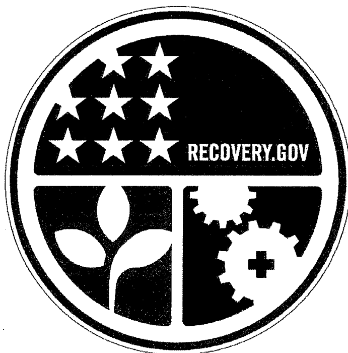
RECOVERY Vector-Based, Vinyl-Ready Pictograph