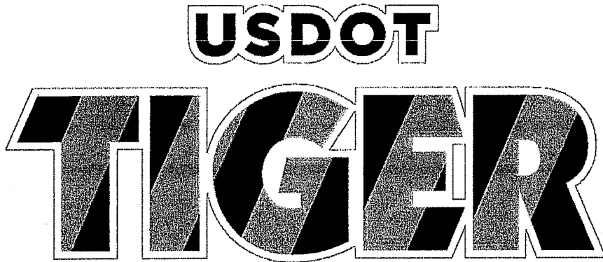
USDOT TIGER Vector-Based, Vinyl-Ready Pictograph

COLORS: OUTLINE - WHITE (RETROREFLECTIVE) USDOT LEGEND - BLACK TIGER DIAGONALS - BLACK, ORANGE (RETROREFLECTIVE)