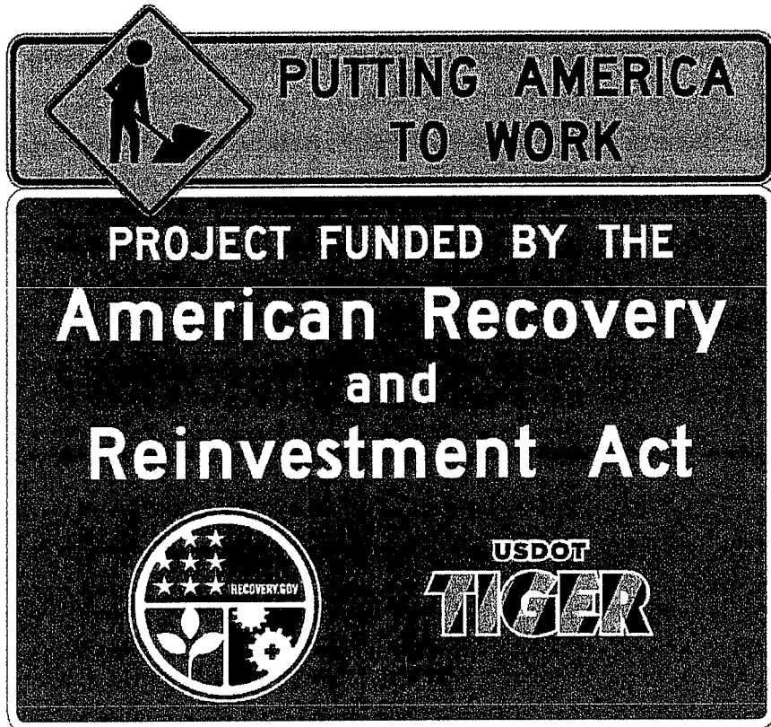
PROJECT FUNDING SOURCE SIGN ASSEMBLY