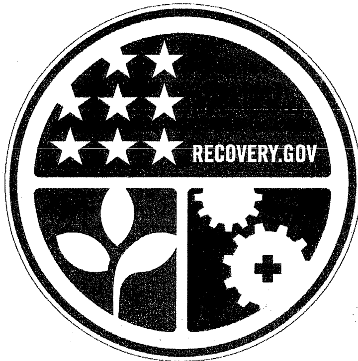
RECOVERY Vector-Based, Vinyl-Ready Pictograph

COLORS: LEGEND, OUTLINE — WHITE (RETROREFLECTIVE) BORDER — BLUE (RETROREFLECTIVE) BACKGROUND (UPPER) — BLUE (RETROREFLECTIVE) BACKGROUND (LOWER RIGHT) — RED (RETROREFLECTIVE) BACKGROUND (LOWER LEFT) — GREEN (RETROREFLECTIVE)