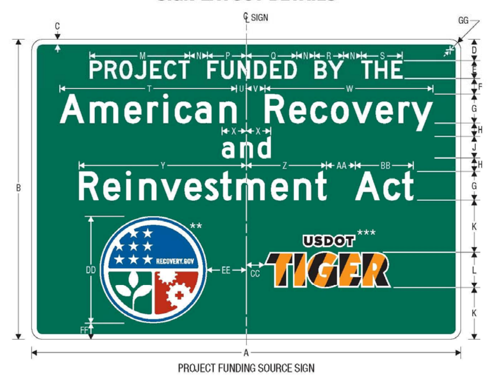
NOTE: SIGN SHALL NOT BE INSTALLED WITHOUT PROJECT FUNDING SOURCE PLAQUE