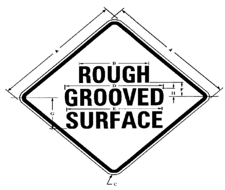
COLOR: LEGEND AND BORDER — BLACK NON-REFLECTORIZED BACKGROUND — ORANGE REFLECTORIZED