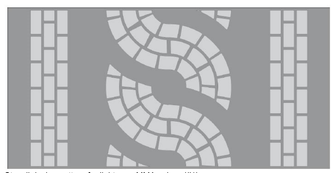
Stencil design pattern for light gray MMA color - (#1)