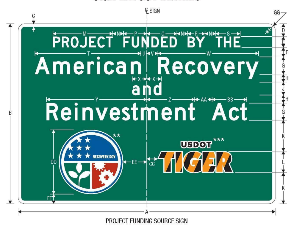
NOTE: SIGN SHALL NOT BE INSTALLED WITHOUT