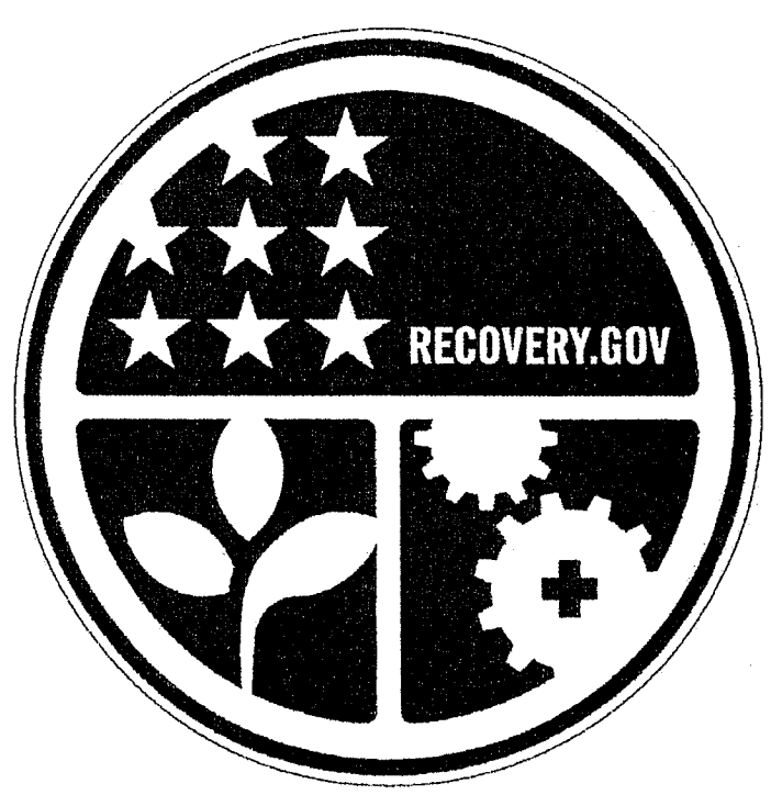
RECOVERY Vector-Based, Vinyl-Ready Pictograph