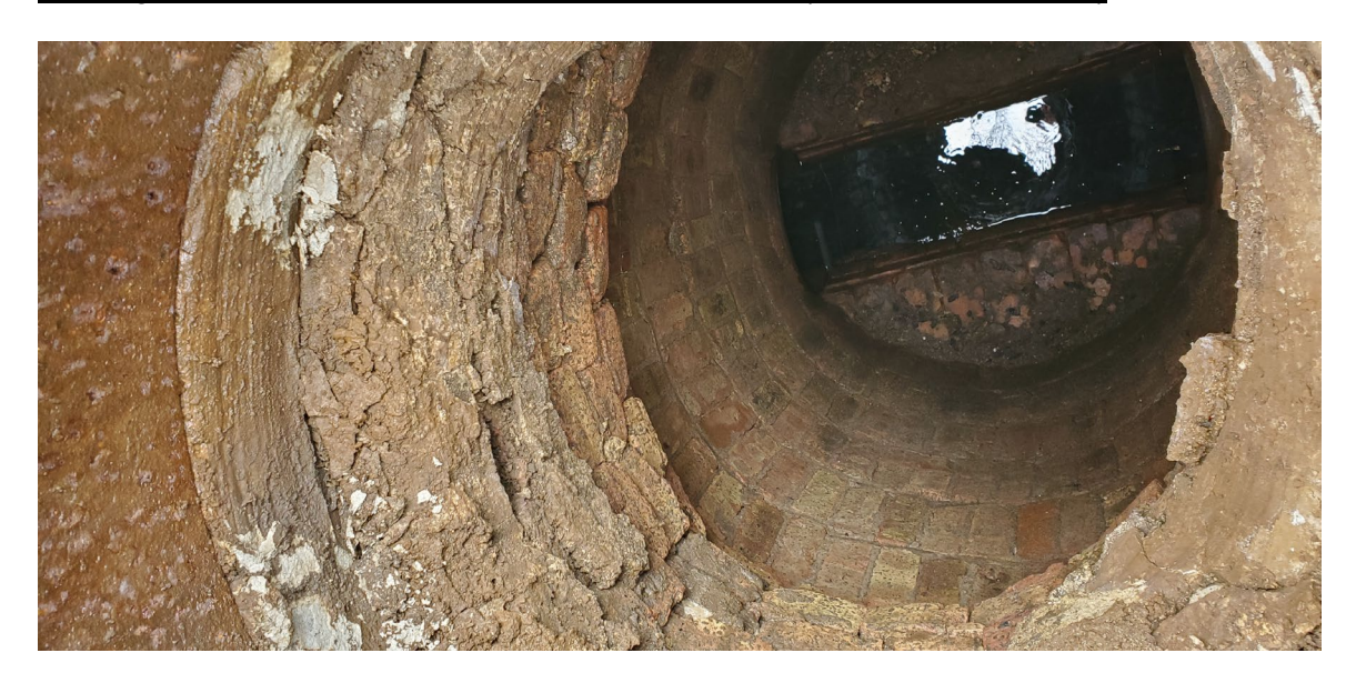
Existing Reconstructed San MH with precast cone section for reference (san mh sta 145+25)