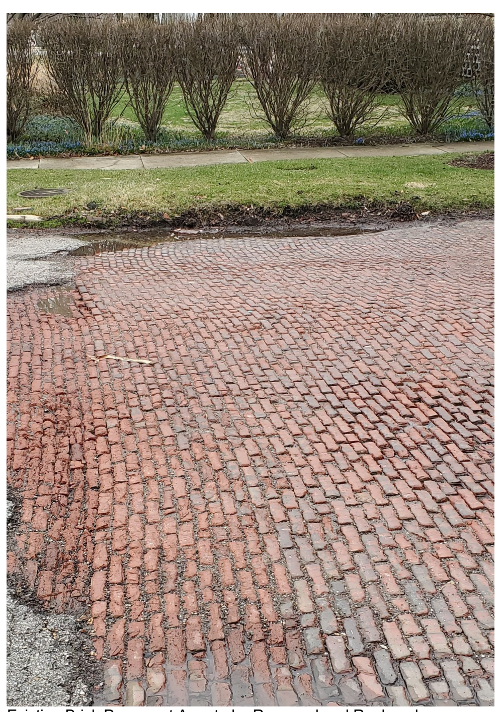
Existing Brick Pavement Area to be Removed and Replaced.

Basis of Payment: The removal of the existing paver bricks, resetting of the paver bricks, repair of sub-base sand materials and installation, and all completed work as described above, will be paid for at the contract unit price bid per square foot for BRICK PAVEMENT REMOVAL AND REPLACEMENT, which will include all materials, labor and equipment required to complete the work.